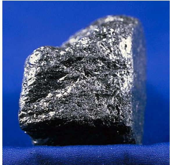
Graphite in mineral form

Graphite particles don't migrate through an oil paint film, but the material is denser than charcoal and can mix readily with paint, staining light colors in the first application. Also, as paint ages and becomes increasingly transparent marks underneath may become more visible.