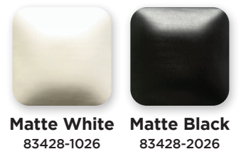
Matte White 83428-1026 Matte Black 83428-2026

Add a softly muted look to your ceramics with a matte finish.