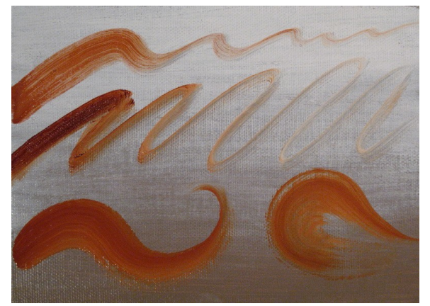
Use for "oiling out" dry paint surfaces to improve brush movement, restore the wet appearance of color and facilitate suave transitions between passages.