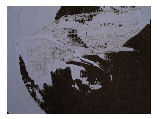
Can be used to create a wide range of consistencies including flat coverage, glazes and drips.