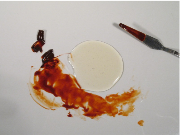
Add to transparent colors for deep, clear glazes.