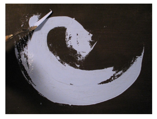
Ideal for broad, "one-stroke" applications that cover without "breaking" on the canvas.