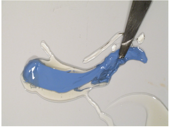
Modify oil colors with Stand Oil medium for long, fluid strokes and subtle blending.