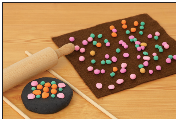
Step 3: Position the clay tile balls on the larger slab and gently roll with a leveled rolling pin.