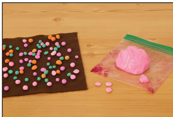
Step 2: Roll clay into small balls and allow to dry.