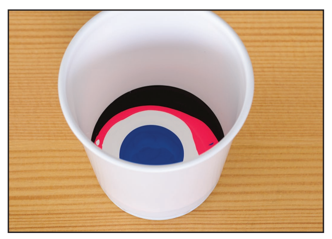
Step 1: In a small paper cup, squeeze out just enough paint to cover the bottom. Create a pool in the center with a second color. Repeat, squeezing paint into the center of each color, forming a "bullseye."