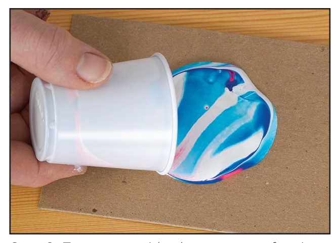
Step 2: Turn cup upside-down on top of a piece of chipboard and allow paint to flow out into a puddle.