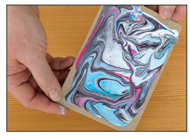
Step 3: Hold the board upright and rotate it, allowing paint to run in all directions until the board is covered.