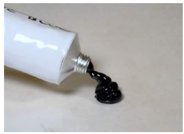
Mass Tone is the appearance of a color straight from the tube or jar.

The range from mass tone to undertone gives expressive and descriptive potential to a color. Use this test to reveal clean, intense color with the classic characteristic appearance of the component pigment.