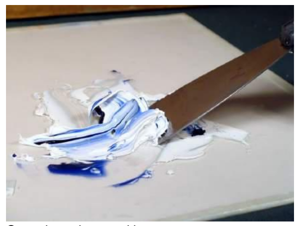
Once the palette and instruments are clean, proceed to the second sample.

Clean knives and palette thoroughly so no trace of the first test sample remains.