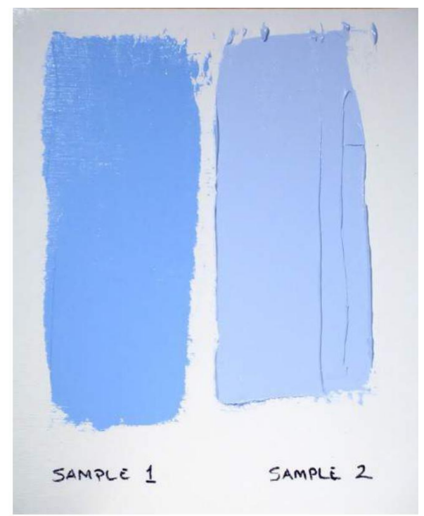
When a homogeneous mixture has been achieved, use the putty knife to place a stripe of sample #2 on the canvas board, as close as possible to the first without mixing or touching.