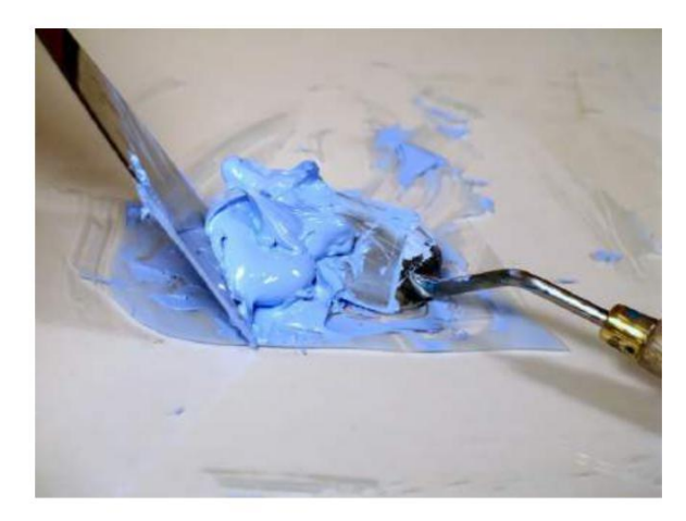
Use the palette knife to scrape down the sides of the putty knife so no unmixed color remains.