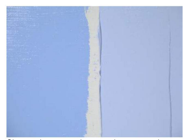
Observe the contrast between the two samples. The sample with better dispersed, more heavily pigmented paint will exhibit a greater degree of color change, and will appear more intense and dark. Firmly scrape down the bottom half of each sample to reveal undertone.

Questions? Ask the Expert Intended for reference only. Observe all package instructions. Dick Blick Holdings/Utrecht Art Supplies is not responsible for any damage to personal property that may result from use of the information presented herein. © Copyright 2017 Dick Blick Holdings Inc. All rights reserved.