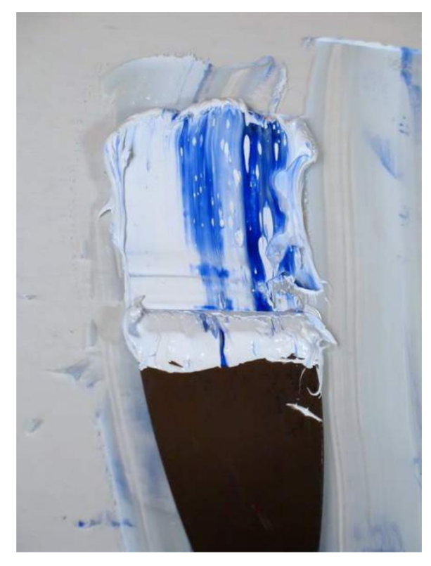
Use the putty knife to combine the sample color and white, alternately spreading and gathering.

Place the white paint on the glass palette along with the first sample of color. Use a palette knife to remove as much paint as possible from each spoon.