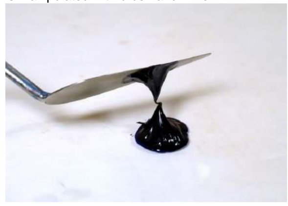
Distribute a small amount of paint on the glass palette.

"Workability" describes how well paint can be moved and distributed, and how well it facilitates strokes and surfaces. This test reveals essential physical behavior when paint is manipulated with brush and knife.