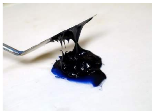
Press down with a palette knife and lift. Note the "length" of the sample, whether it pulls in strings or breaks short.