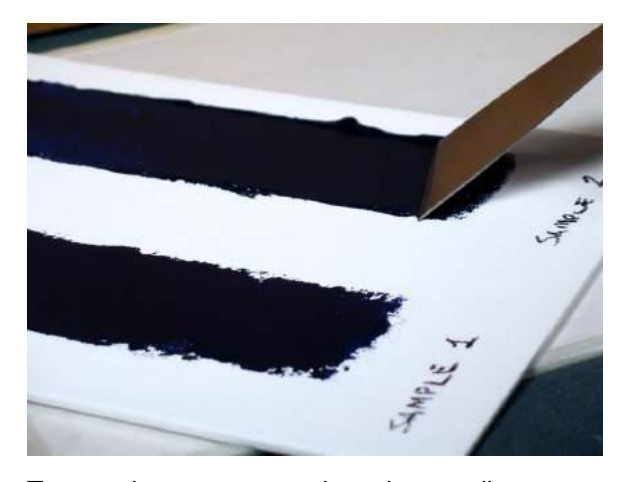
To examine mass tone, deposit a small amount of paint on the glass palette and gather it on the putty knife. Perform a draw-down on a