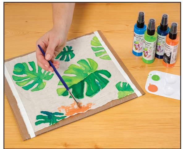
Step 2: Apply color with a brush, or straight from the bottle.