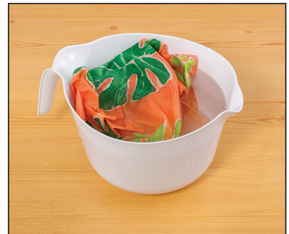
Step 3: Rinse out glue in warm water.