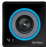
Prime 41 Systems from $54k