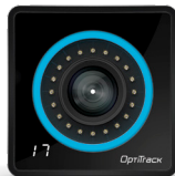
Prime 17W Systems from $38k