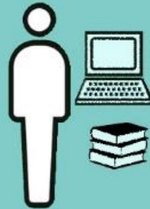
ኣድሽ ነገር ምምሃር