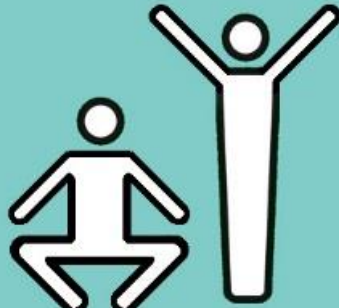
ኩል ግዜ ምንቅስቃስ