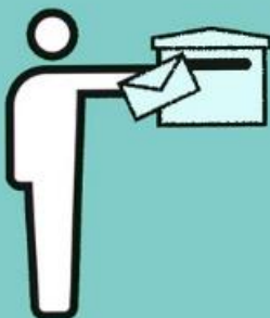
ምስ የዕርኽቱኽ ኩል ግዜ ምርኽብ