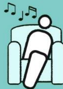
ነፍስኻ ምፍታሕ (ምርያሕ)