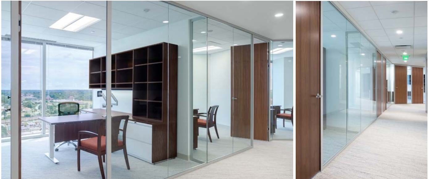
Transparent: Rooms created with UNIQUIN are bright and friendly.

Office spaces are given a healthy, communicative atmosphere with UNIQUIN: glass walls combined with attractive design from UNIQUIN create open and enticing spaces. Acoustically separated from the hustle