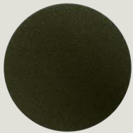
(383) AL Similar DB 703 Fine Texture Powder Coated