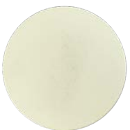
(384) AL White Fine Texture Powder Coated RAL 9016