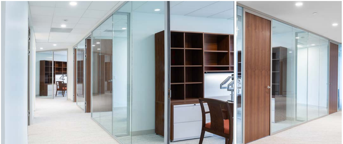
The UNIQUIN frame system is suitable both for rooms where full transparency is desirable and for individual door solutions. Variation is also possible: wood, for example, can provide visual interest and discretion where it is required.

and bustle, UNIQUIN offers an impressive STC rating. Here everyone can find the peace of mind they need to be productive while staying close to the action.