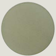
(318) AL Similar EV 1 Powder Coated (Clear Anodized)