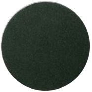
(382) AL Graphite Powder Coated Scratch Resistant