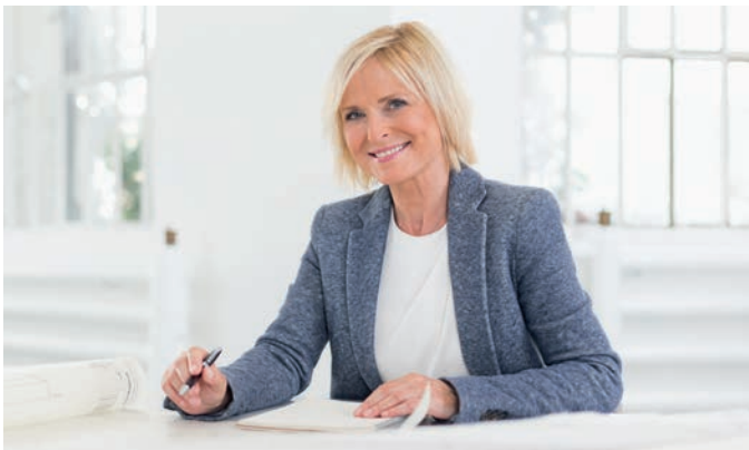
UNIQUIN offers a high level of flexibility in room configuration.

This allows you to adopt your own, harmonious mix of transparent and opaque elements, combining panoramic views with discreet privacy at your discretion.