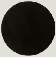
(385) AL Black Fine Textured Powder Coated (RAL 9005)