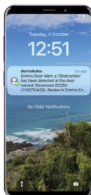
Real-time alerts (SMS and email)