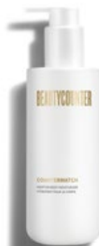
Adaptive Body Moisturizer $39 USD | $51 CAD

Achieve 24 hours of hydration* and smoother, youthful-looking tone with this breakthrough body lotion.