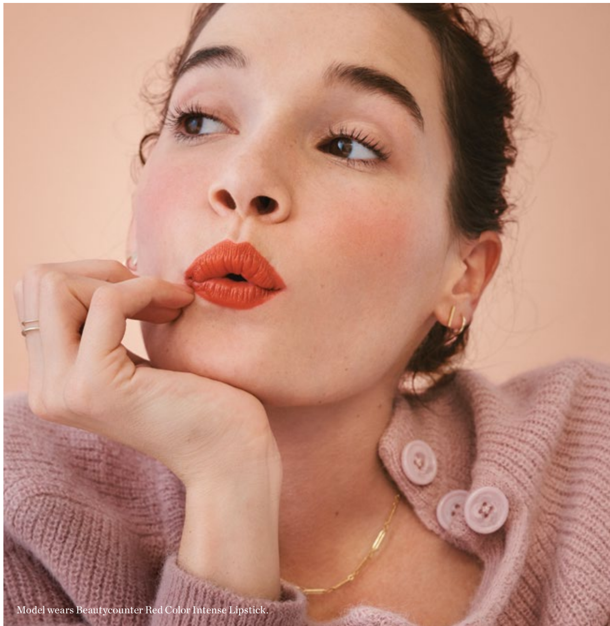
Model wears Beautycounter Red Color Intense Lipstick.

Glossy, sheer, or bold—find an option that's made in your shade.