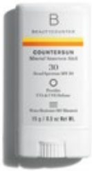
Mineral Sunscreen Stick SPF 30 $21 USD | $27 CAD

This luxurious sunscreen lotion blends evenly and is water resistant. SKU 3042 | US ONLY 100 ml / 3.4 fl oz