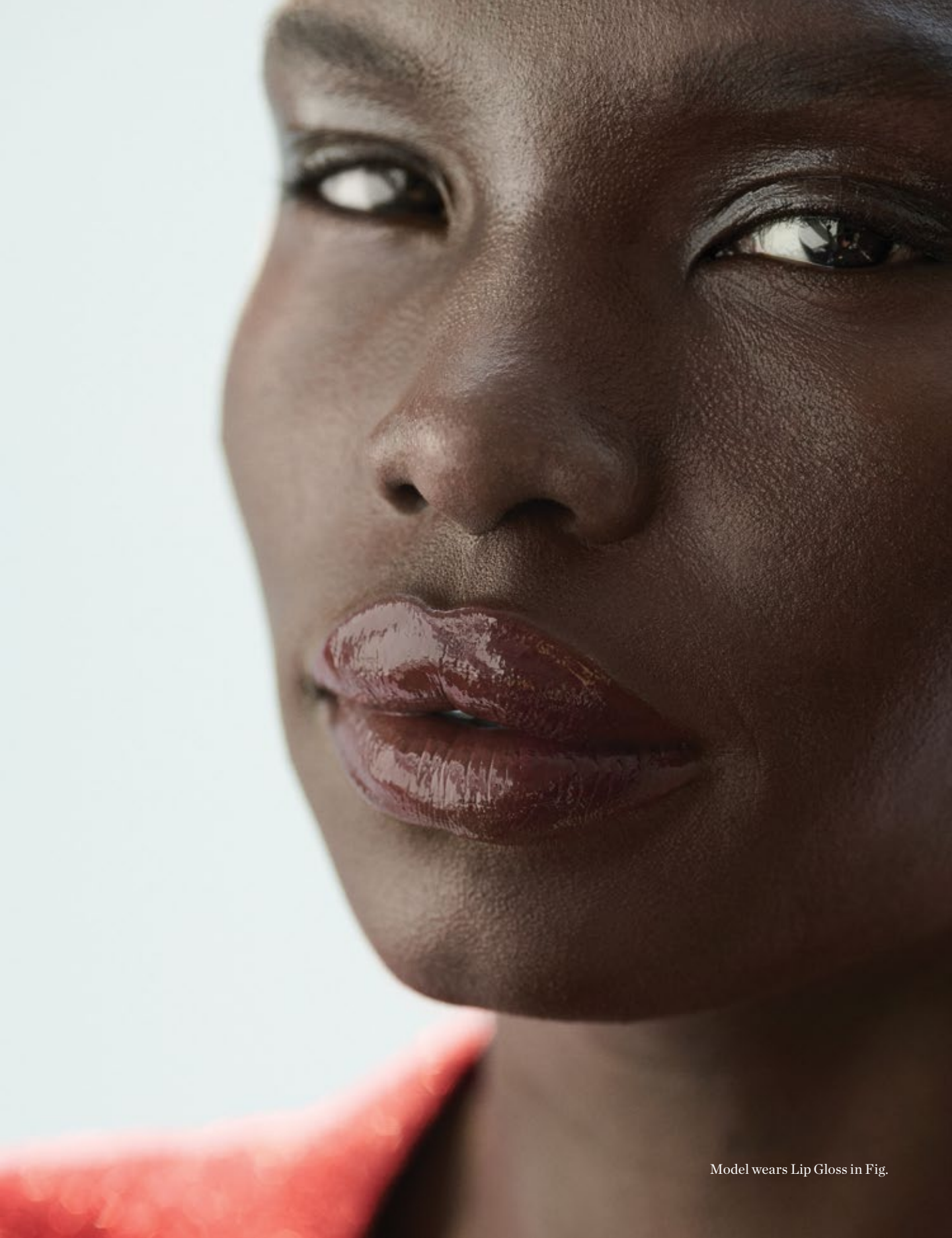
Model wears Lip Gloss in Fig.