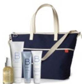
The Ultimate Baby Collection $162 USD | $184 CAD

Includes: Calming Diaper Rash Cream, Gentle All-Over Wash, Daily Protective Balm, Baby Soothing Oil, and Diaper Bag (with zipper pouch and changing pad).