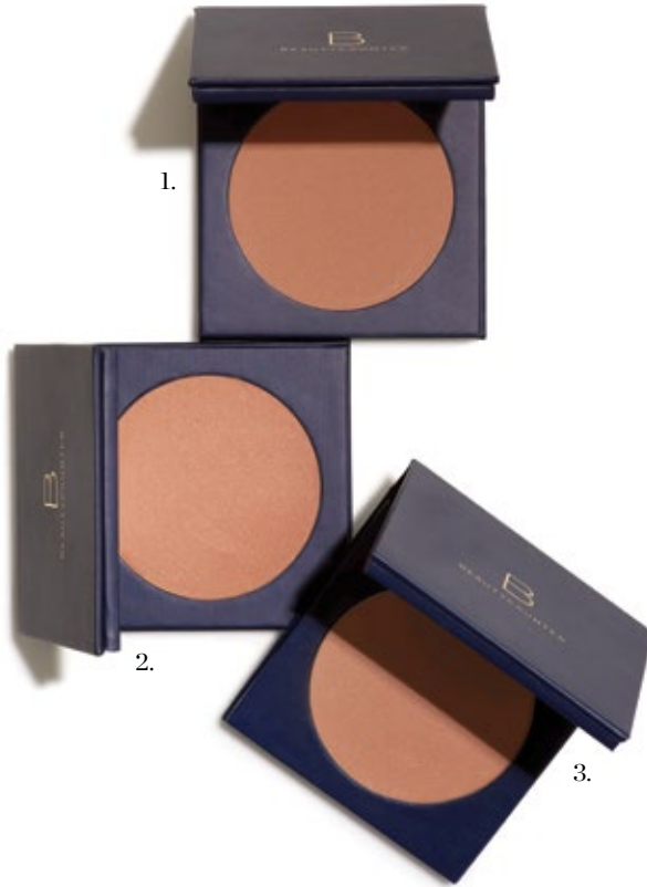
1. Cabana (SKU 2157), 2. Dune (SKU 2155), 3. Surf (SKU 2156)