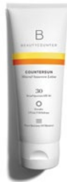
Mineral Sunscreen Lotion SPF 30 $39 USD | $49 CAD

This continuous mist sunscreen sprays on white, blends in easily, and dries quickly. SKU 3046 US / 3146 CAN 89 ml / 3 fl oz