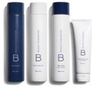
Body Collection $96 USD | $121 CAD

Includes: Body Wash in Citrus Mimosa, Hydrating Body Lotion in Citrus Mimosa, Daily Shampoo, and Daily Conditioner.