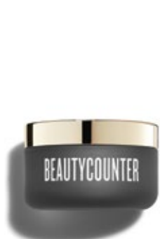
Lotus Glow Cleansing Balm $72 USD | $92 CAD

This balm is a multitasking cleanser and overnight mask featuring a blend of lotus extract, jojoba seed oil, and avocado seed oil.