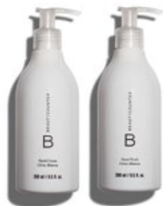
Citrus Mimosa Hand Wash & Hand Cream Set $49 USD | $60 CAD

Refresh and replenish with two gentle formulas designed to revive dry hands. Both the Hand Wash and Hand Cream are packed with our energizing citrus mimosa scent.