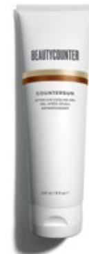
After Sun Cooling Gel $32 USD | $42 CAD

This lightweight after-sun gel cools on contact to help soothe skin post-sun exposure while boosting hydration. SKU 100000221 240 ml / 8 fl oz