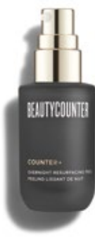
Overnight Resurfacing Peel $63 USD | $80 CAD

Featuring a proprietary multi-acid complex, this leave-on AHA/BHA peel improves skin texture and boosts clarity without irritation or over-drying.