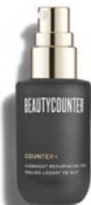
Overnight Resurfacing Peel $63 USD | $80 CAD

Featuring a proprietary multi-acid complex, this leave-on AHA/BHA peel improves skin texture and boosts clarity without irritation or over-drying.