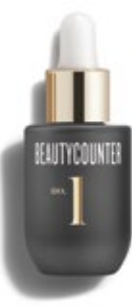
No. 1 Brightening Facial Oil $69 USD | $85 CAD

Designed to help improve the appearance of skin radiance. Omega-rich marula oil provides intense hydration, while antioxidant vitamin C helps brighten and even skin tone.