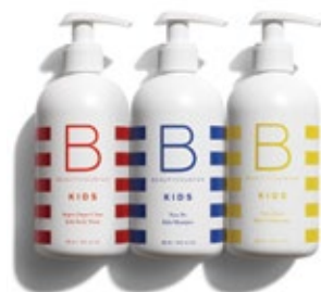
Kids Bath Collection $45 USD | $57 CAD

This trio includes our berry-scented Kids Body Wash as well as our citrus vanilla-scented Nice Do Shampoo and Not a Knot Conditioner.