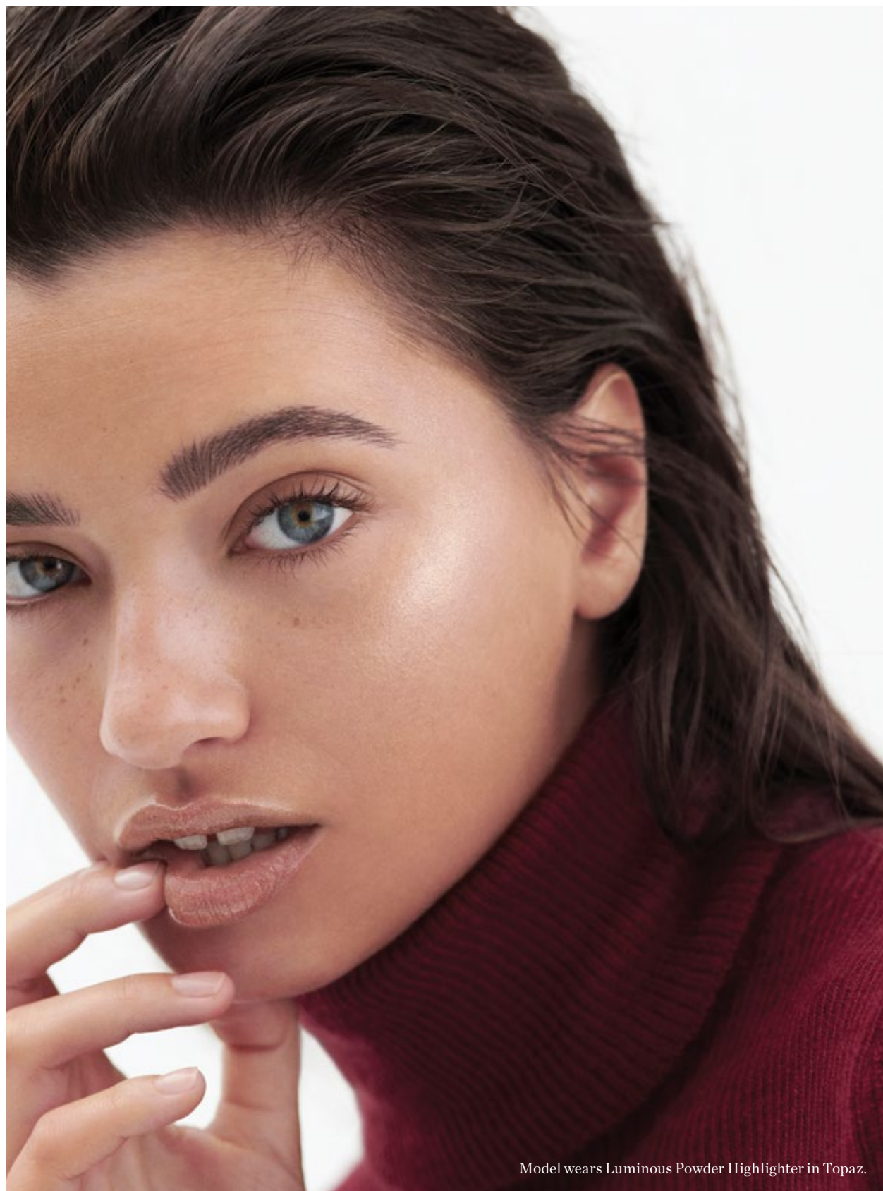
Model wears Luminous Powder Highlighter in Topaz.