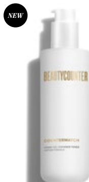
Hydra-Gel Radiance Toner $45 USD | $58 CAD

A glow-boosting formula of squalane, plum oil, and phytic acid provides skin with optimal hydration and nutrition while removing residual impurities.