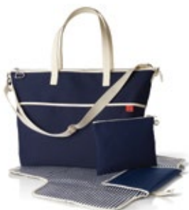
Classic Diaper Bag $98 USD | $118 CAD

Keep all your baby essentials together in this stylish canvas tote, which includes a changing pad with an easy-to-clean, zipped canvas pouch.