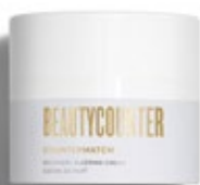
Recovery Sleeping Cream $56 USD | $72 CAD

A blend of hyaluronic acid, plum oil, and squalane helps replenish hydration and create a protective layer to shield skin from moisture loss.