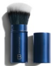
Retractable Foundation Brush $35 USD | $44 CAD

Designed specifically for liquid foundation, this dome-shaped brush is a must-have for even coverage.