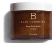
Sugar Body Scrub in Lemongrass $40 USD | $49 CAD

With a blend of nourishing oils and invigorating brown sugar, this scrub buffs away dry skin, leaving the body with a healthy-looking glow.