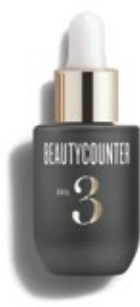
No. 3 Balancing Facial Oil $69 USD | $85 CAD

Designed to help hydrate, smooth, and even skin tone. Softening meadowfoam seed oil helps restore balance, while ylang ylang provides a delicate scent.