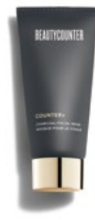
Charcoal Facial Mask $49 USD | $62 CAD

This kaolin clay mask purifies and balances, absorbing excess oil and drawing out impurities. Salicylic and lactic acids aid in gentle exfoliation.