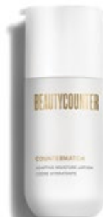
Adaptive Moisture Lotion $49 USD | $62 CAD

This lightweight lotion provides essential nutrition and oxygenation to keep skin soft and glowing for up to 24 hours of hydration*.