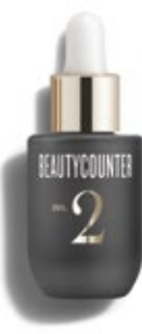
No. 2 Plumping Facial Oil $69 USD | $85 CAD

Formulated to help hydrate, nourish, and visibly firm skin. Jasmine floral wax provides a subtle floral scent while omega-rich argan oil helps deliver omega acids to the skin.