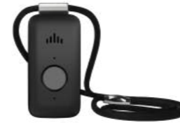
On the go TELUS Health Medical Alert Pendant

You're in good hands with TELUS Health — the largest Canadian-owned medical alert provider.