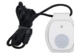
At home LivingWell Companion™ Home