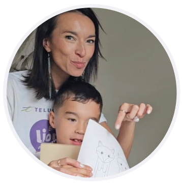
② Heavy print paper/regular print paper and cardstock