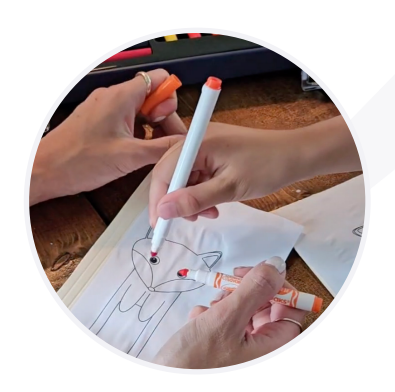
② Colour your bookmark with the colouring material of your choice.

① Print the bookmark on page 3 and outline in black and white on heavy print paper. Or, print it on regular paper and glue it to cardstock. Also, you can make your own critter by cutting out shapes with construction paper.