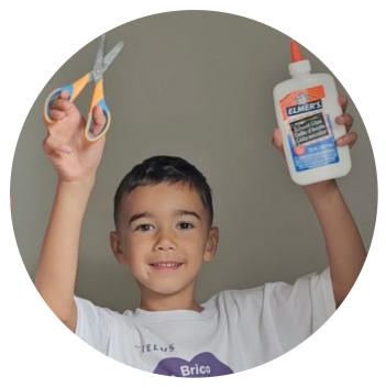
4 Scissors and glue