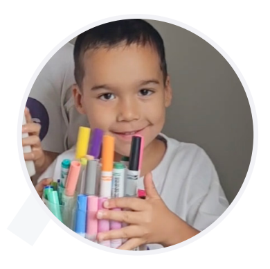
③ Colouring materials (like crayons, coloured pencils, markers or paints)