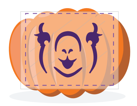
Step 5: Secure the stencil Cover stencil with plastic wrap to hold it in place.