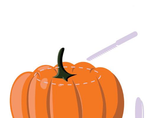
Step 1: Carve the lid

Use the felt pen to draw a circular lid on top of the pumpkin. Angle the knife inward slightly to prevent it from falling in and cut out the lid.