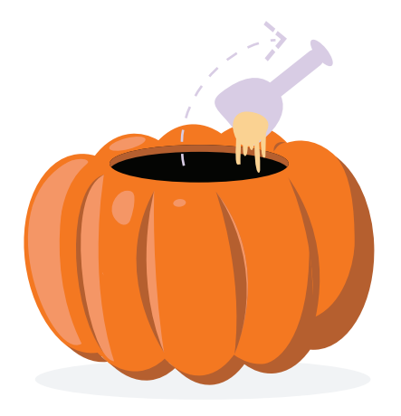
Step 2: Scoop and clean Remove the seeds and strings from inside the pumpkin using the scoop.