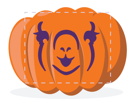
Step 4: Apply stencil Place the wet stencil on the pumpkin.