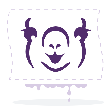
Step 3: Soak the stencil Soak the stencil in water to make it more pliable.

Use the felt pen to draw a circular lid on top of the pumpkin. Angle the knife inward slightly to prevent it from falling in and cut out the lid.