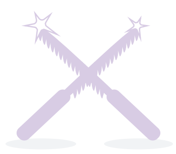
Step 6: Carve your design Carefully carve along the stencil lines to create your pumpkin design. Enjoy your artistic creation.