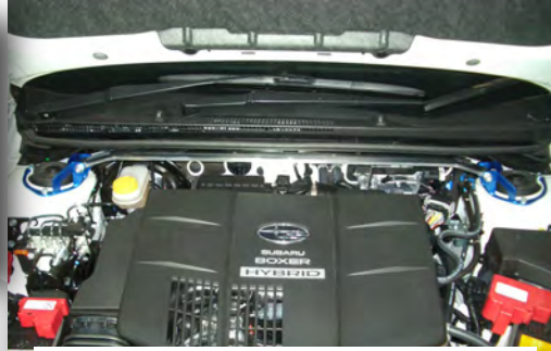
Front Strut Bar Type OS (GPE) Part No: 694 540 A MSRP: $200.00