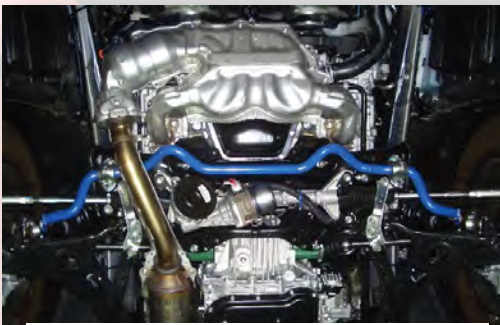
Front Sway Bar (26mm) (GPE) Part No: 695 311 A26 MSRP: $347.00