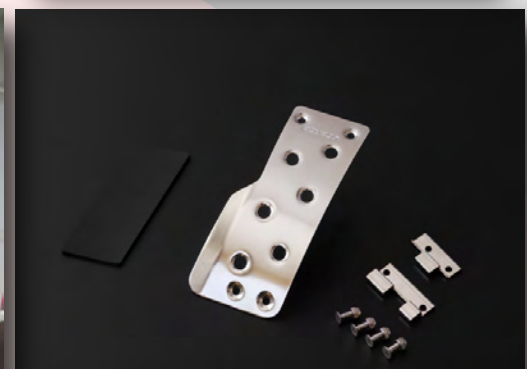
Sports Accel Pedal (GP7 MT only) Part No: 965 766 A MSRP: $51.00