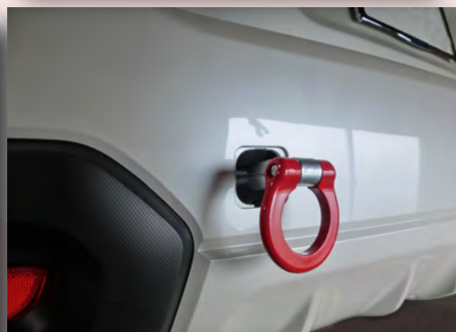
Rear Folding Tow Hook (GP7 & GPE) Part No: 693 017 R MSRP: $131.00