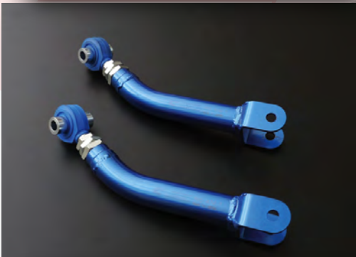
Adjustable Rear Trailing Rod (Pillow) (GPE) Part No: 965 474 T MSRP: $467.00