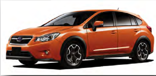
SUBARU XV CROSSTREK (GP7)& HYBRID (GPE) New Additional Products - Updated