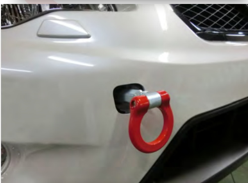
Front Folding Tow Hook (GP7 & GPE) Part No: 965 017 F MSRP: $131.00