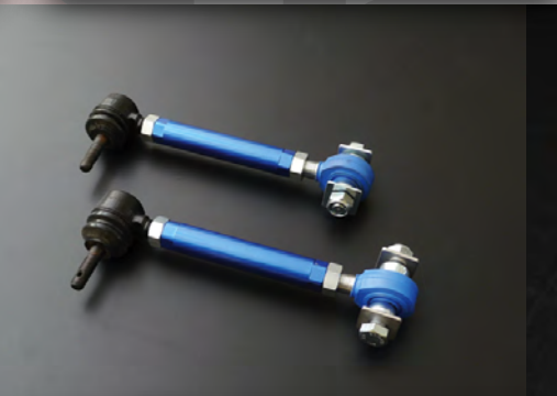
Adjustable Rear Lateral Link (Front) (GPE) Part No: 692 474 LA MSRP: $600.00