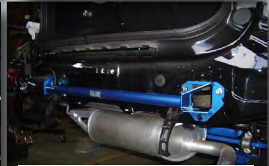
Powerbrace Rear End (GPE) Part No: 687 492 RE MSRP: $227.00