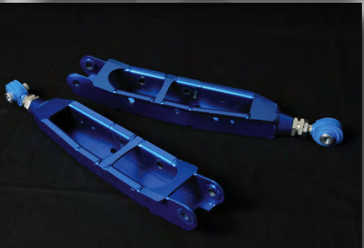
Adjustable Rear Lateral Link (Rear Side) (GPE) Part No: 692 474 L MSRP: $574.00