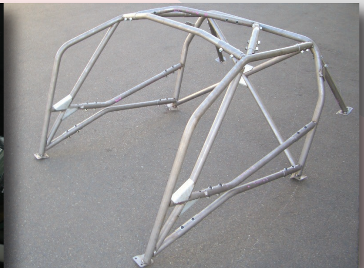
*Proton Satria Neo FIA Joint Rollcage shown