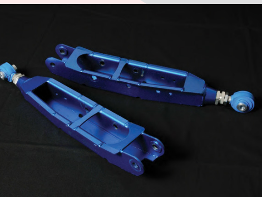
Adjustable Rear Lateral Link (Rear Side) Part No: 692 474 L MSRP: $574.00