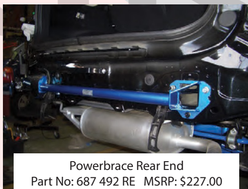
Powerbrace Rear End Part No: 687 492 RE MSRP: $227.00