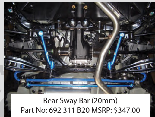
Rear Sway Bar (20mm) Part No: 692 311 B20 MSRP: $347.00