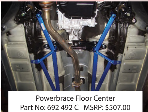
Powerbrace Floor Center Part No: 692 492 C MSRP: $507.00