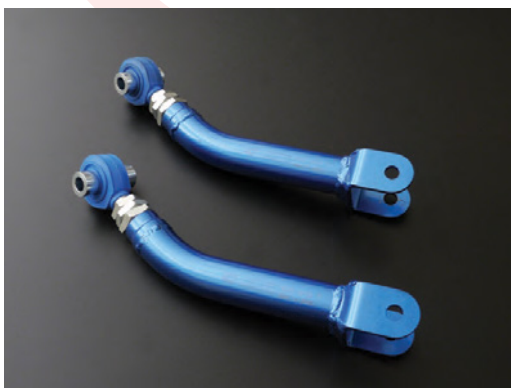
Adjustable Rear Trailing Rod (Pillowball) Part No: 965 474 T MSRP: $467.00