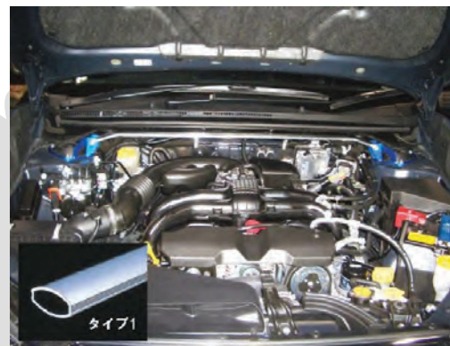
Front Strut Bar Type OS Part No: 694 540 A MSRP: $200.00