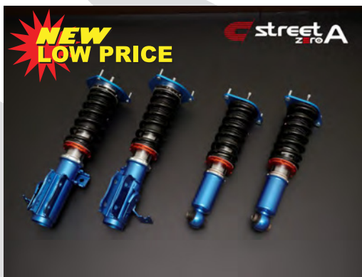
Full Pillowball Mount Kit Fr: Pillowball Rr: Rubber Kit Part No: 695 61N CP Part No: 695 61N CN MSRP: $1,800.00 MSRP: $1,600.00