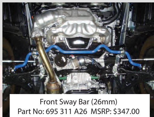
Front Sway Bar (26mm) Part No: 695 311 A26 MSRP: $347.00