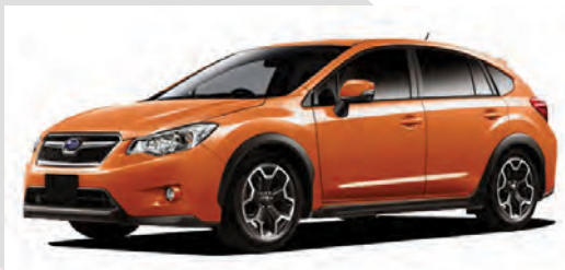
SUBARU XV CROSSTREK (GP7) New suspension & Chassis Products