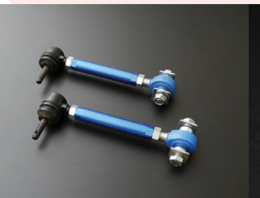
Adjustable Rear Lateral Link (Front Side) Part No: 692 474 LA MSRP: $600.00