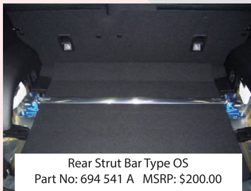
Rear Strut Bar Type OS Part No: 694 541 A MSRP: $200.00