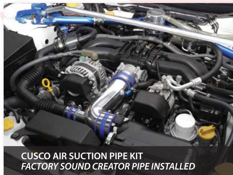
CUSCO AIR SUCTION PIPE KIT FACTORY SOUND CREATOR PIPE INSTALLED

To make this product 100% factory replacement, the OEM "Sound Creator" pipe was still made to be compatible with the aluminum air suction pipe. The sound creator function can also be eliminated by installing an bung to the port, completely sealing off any air flow to the air intake system. Completely compatible with factory ECU.