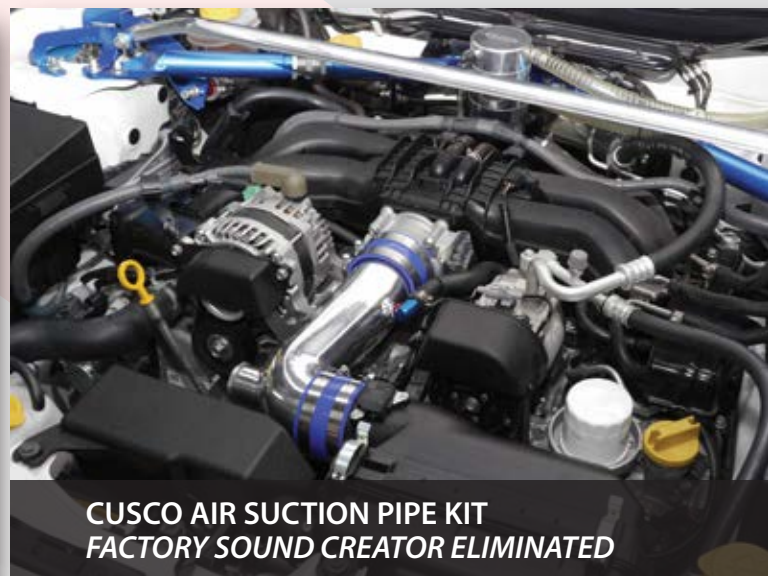
CUSCO AIR SUCTION PIPE KIT FACTORY SOUND CREATOR ELIMINATED