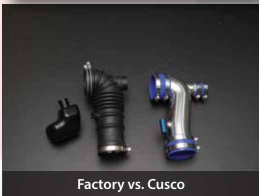
Factory vs. Cusco

Application: (ZN6) Toyota FT86, Scion FR-S, (ZC6) Subaru BRZ Part Number: 965 033 A MSRP: 200.00 (USD)