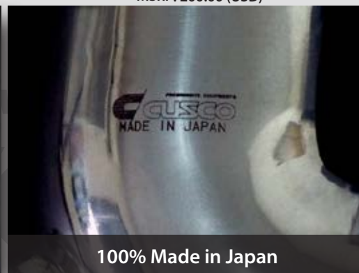
100% Made in Japan