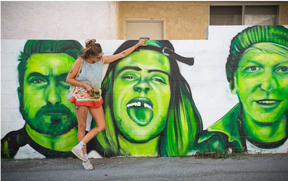
The Salty Shuttters