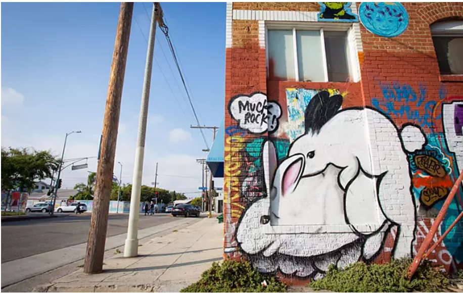
The Salty Shuttlers