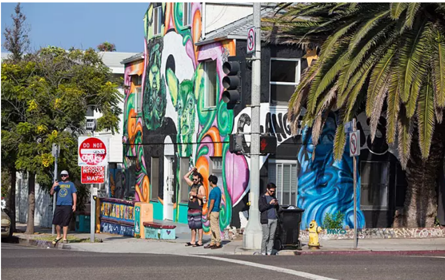
The Salty Shuttlers