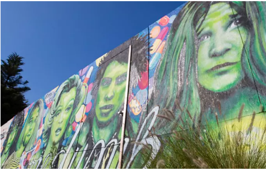
The Salty Shuttlers

A short stroll down Main takes you to another one of her breakthrough murals—the 'Freedumb Wall', a series of portraits of iconic entertainers (music is a recurrent theme in her work); Morrison, Cobain, Monroe, Vicious, and Joplin all captured in her trademark green.