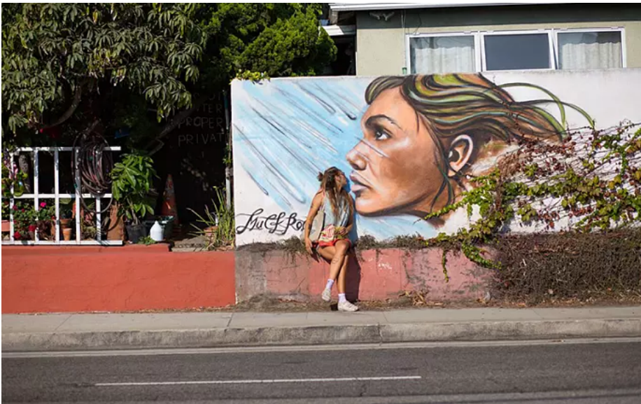
The Salty Shuttlers

A short stroll down Main takes you to another one of her breakthrough murals—the 'Freedumb Wall', a series of portraits of iconic entertainers (music is a recurrent theme in her work); Morrison, Cobain, Monroe, Vicious, and Joplin all captured in her trademark green.