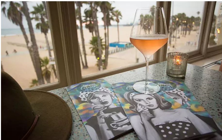
The Salty Shutters