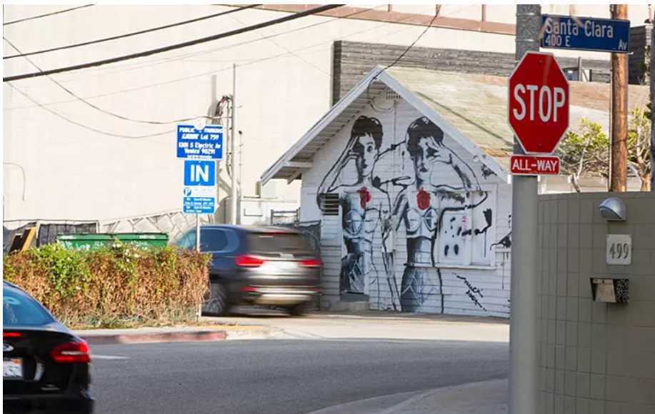
The Salty Shuttlers