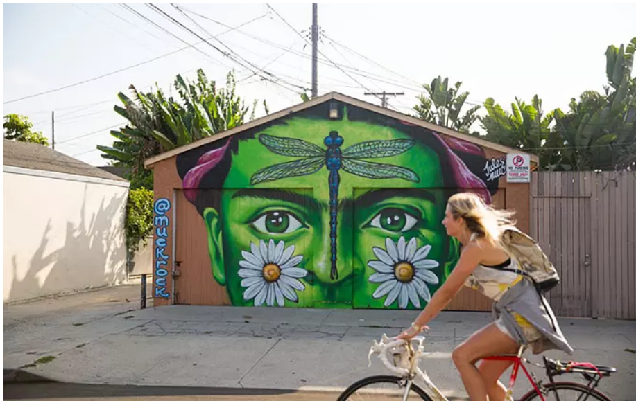
The Salty Shuttlers