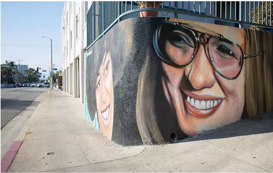
The Salty Shuttters