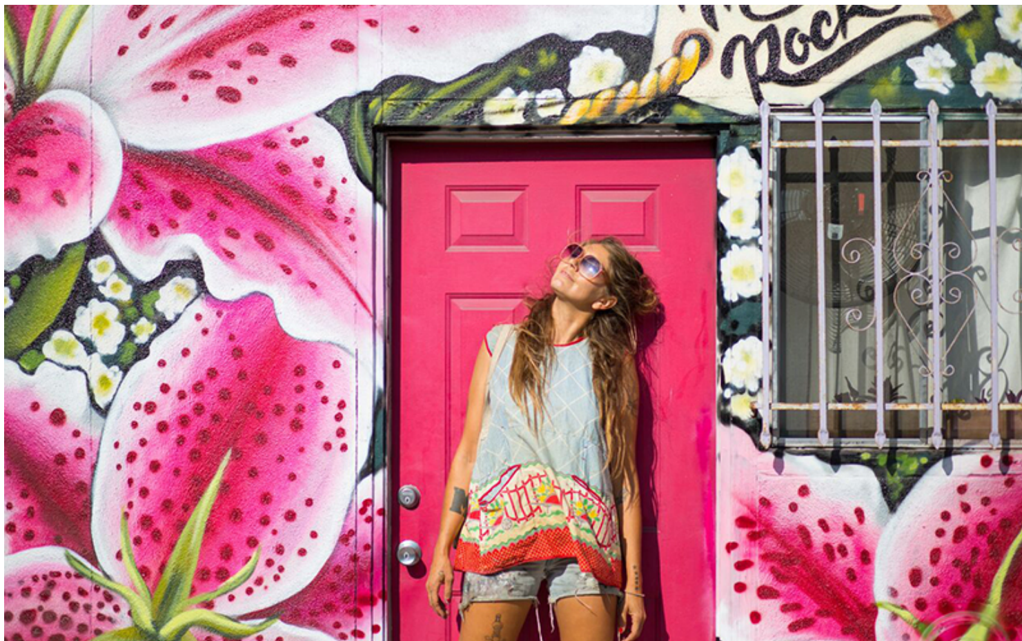
The Salty Shutters