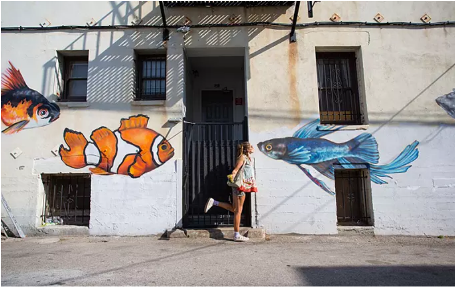
The Salty Shutters

The work is as captivating and energetic as the artist herself.