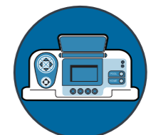
MMI – interactive digital interface