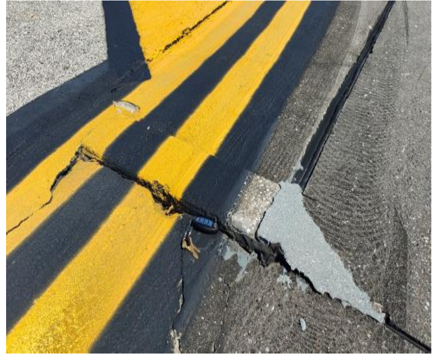
Taxiway SH Exit Shoulder Joint Failure & PCC Blowout