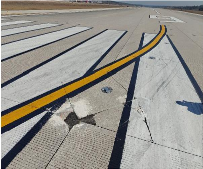
Light Blockout Damage