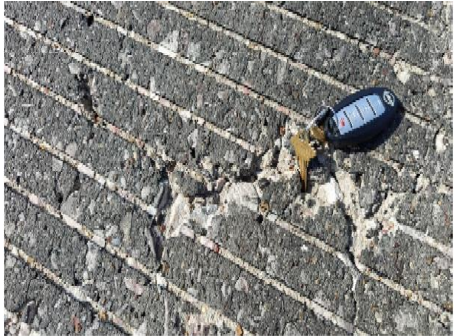
Damage Surface Due to Rubber Removal