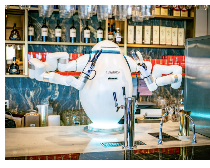
Richtech Robotics ADAM

Scythe Robotics has tackled the tedious task of mowing the lawn with autonomous, electric lawn mowers. (And getting rid of ghastly two-stroke lawnmower engines in the process! Due to having worse combustion than a four-stroke car engine, a single hour of operating a petrol-powered mower produces the same amount of smog-forming pollution as driving a petrol-powered car 300 miles.) Matic is delivering the first fully autonomous robot vacuum that finally works (and can mop!). It uses better cameras and sensing to build a full 3D model of the home and not bump into everything in its path. Richtech Robotics built a squad of robots including a production arm, a waiter, a hotel delivery robot, and interactive robot bartenders, baristas, and chefs. Manna Aero is finally making drone delivery happen, supplying coffee