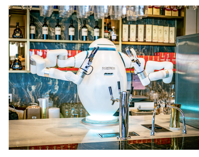
Richtech Robotics ADAM

Scythe Robotics has tackled the tedious task of mowing the lawn with autonomous, electric lawn mowers. (And getting rid of ghastly two-stroke lawnmower engines in the process! Due to their worse combustion than a four-stroke car engine, a single hour of operating a gas-powered mower produces the same amount of smog-forming pollution as driving a gas-powered car 300 miles.) Matic is delivering the first fully autonomous robot vacuum that finally works (and can mop!). It uses better cameras and sensing to build a full 3D model of the home and not bump into everything in its path. Richtech Robotics built a squad of robots including a production arm, a waiter, a hotel delivery robot, and interactive robot bartenders, baristas, and chefs. Manna Aero is finally making drone delivery happen, rappelling coffee and sandwiches from