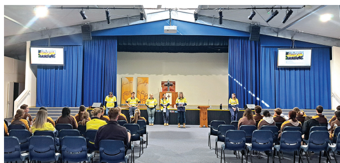
Visiting our local schools to discuss all things about our Apprenticeship and Trainee program.