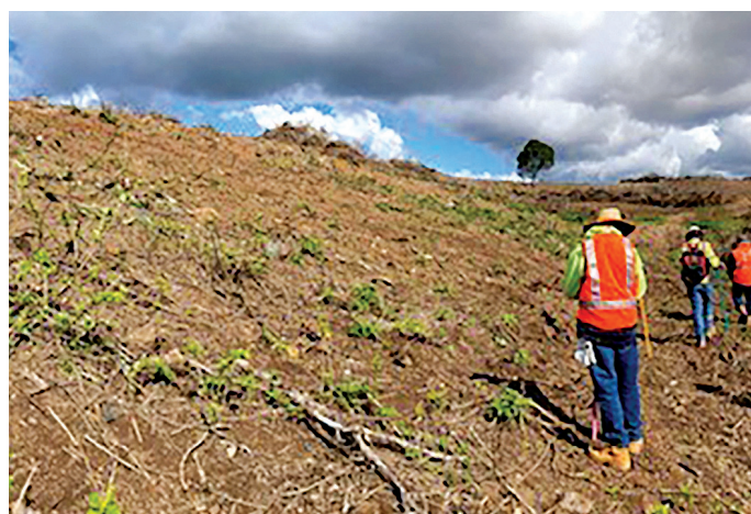
K2E box cut Cultural Assessment team members undertaking survey work in the box cut area.