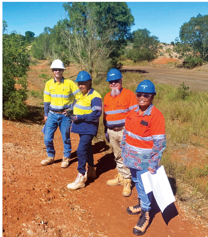
Wakka Wakka Native Title Aboriginal Corporation representatives visited Meandu Mine on 22 April to inspect the progress of the King 2 East box cut cultural heritage survey work.

Initial mining activities include burning off cleared vegetation, topsoil stripping and stockpiling, and installation of erosion and sediment control measures. Bulk excavation of the rock above the coal seams using drill and blast methods will commence, followed by truck and shovel excavation, hauling