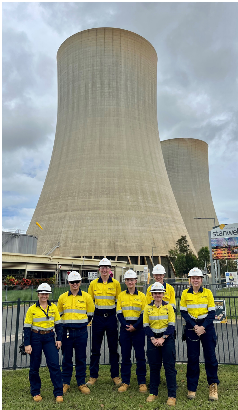
2025 Apprentice and Trainee cohort

“If you’re considering an apprenticeship with Stanwell, I highly recommend it. It’s a great work environment, and the development opportunities are limitless.”