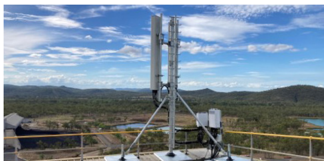
The new mobile infrastructure at Stanwell Power Station

The recent upgrade at Stanwell Power Station now includes the latest 4G and 5G mobile platforms, providing significantly improved mobile service to the station and surrounding Stanwell district.