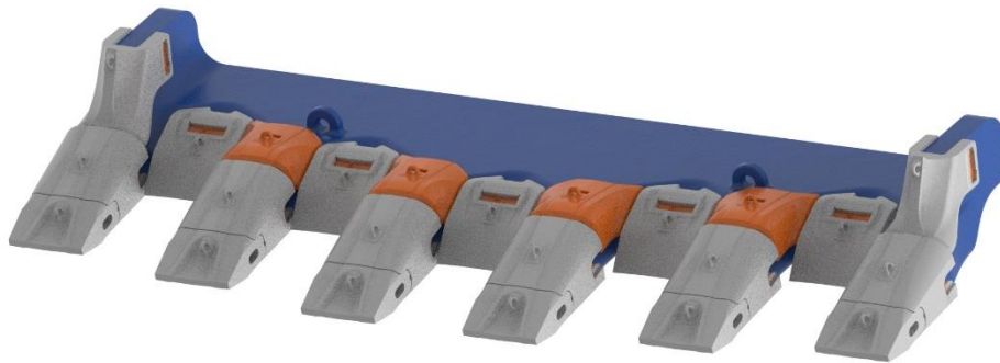
Eclipse® Mid-Adapter and Point GET