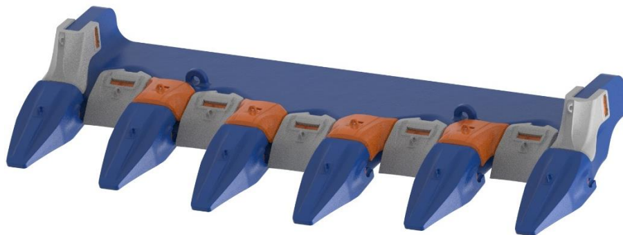
Solid Point GET

Contact your local Bradken representative or visit bradken.com for further information.