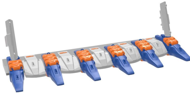
Twistlok Pro GET