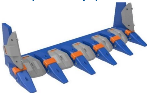
Solid Point GET

Contact your local Bradken representative or visit bradken.com for further information.