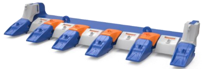
Solid Point GET