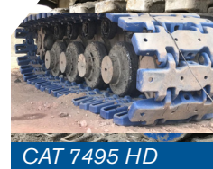
CAT 7495 HD

Brazil, South America Hard Rock/Copper Mine