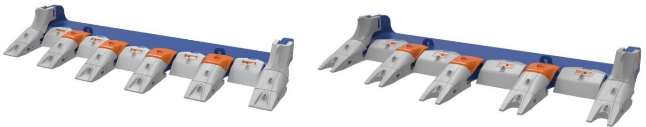
Eclipse® Mid-Adapter and Point GET