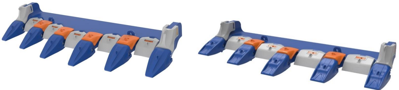
Solid Point GET

Contact your local Bradken representative or visit bradken.com for further information.