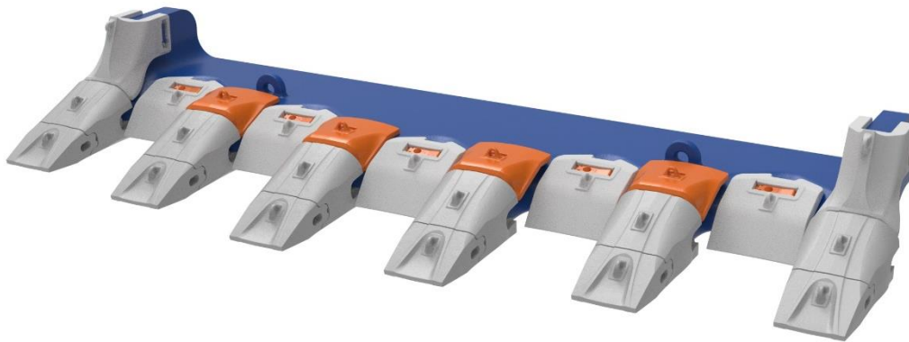
Eclipse® Mid-Adapter and Point GET