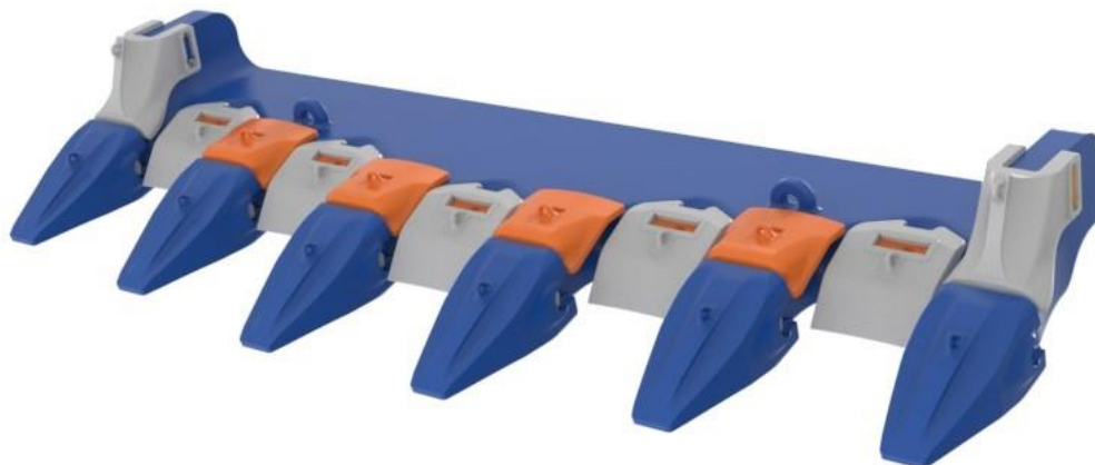
Solid Point GET

Contact your local Bradken representative or visit bradken.com for further information.