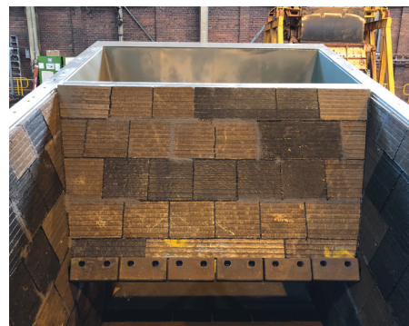
Duaplate DX Application