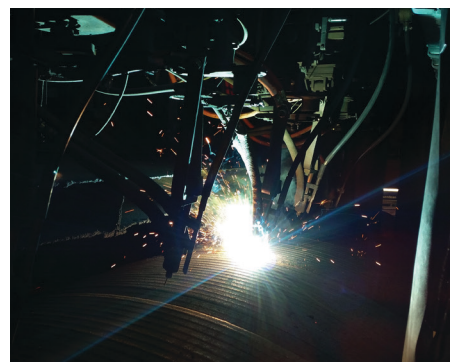
Duaplate Manufacturing Process

Duaplate DX is currently available in the following sizes: 5on8, 8on8 and 16on8