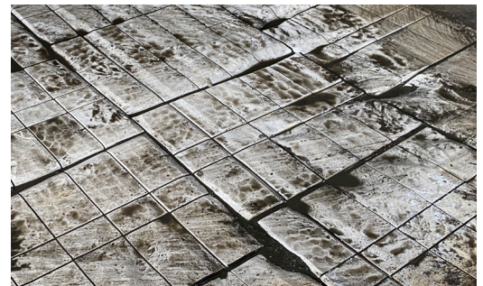
Vulcabrix® ZTA Liners