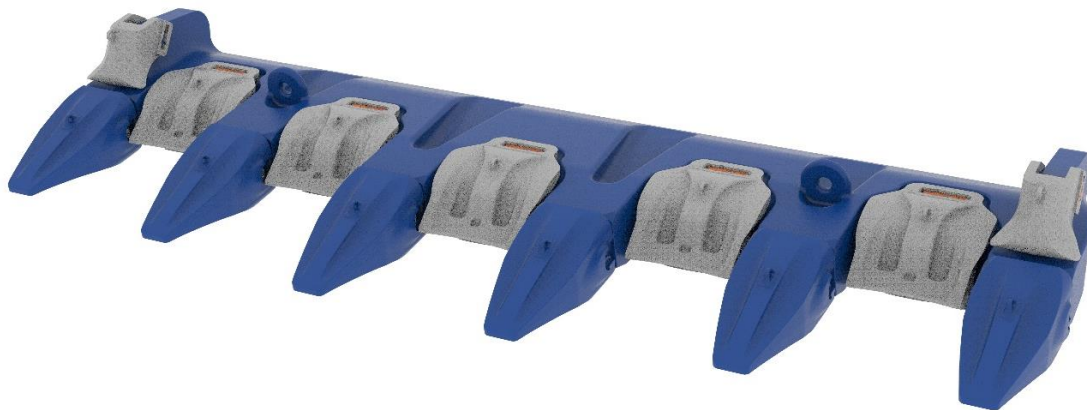
Solid Point GET

Contact your local Bradken representative or visit bradken.com for further information.