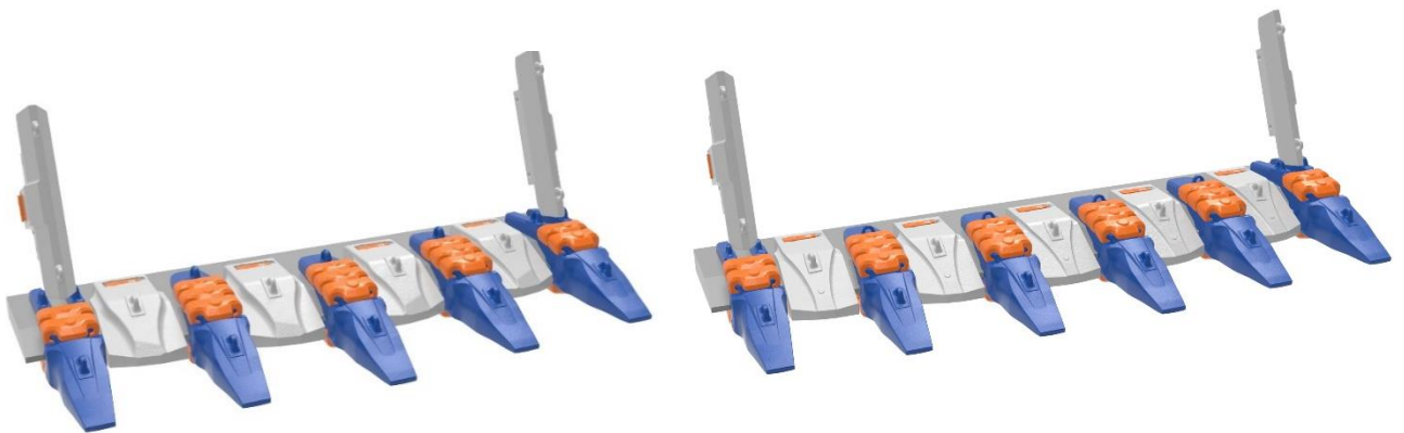
Twistlok Pro GET

Contact your local Bradken representative or visit bradken.com for further information.