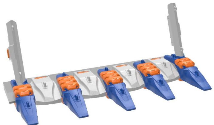
Twistlok Pro GET

Contact your local Bradken representative or visit bradken.com for further information.