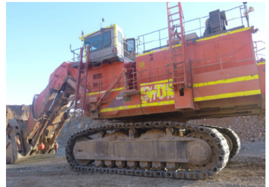
EX5500 Excavator Undercarriage