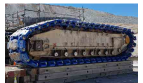
P&H® 2800 XPB

Chile, South America Hard Rock, Copper Mine