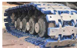
CAT® 7495 HD

Brazil, South America Hard Rock, Copper Mine