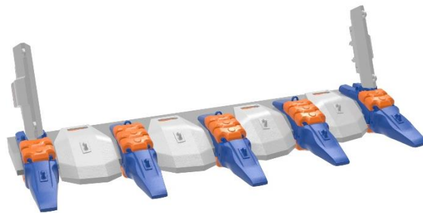
Twistlok Pro GET