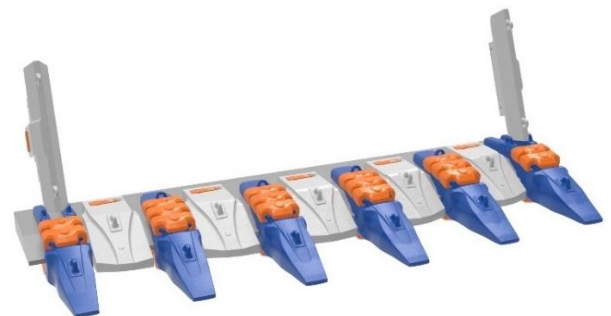
Twistlok Pro GET

Contact your local Bradken representative or visit bradken.com for further information.