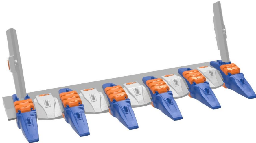
Twistlok Pro GET

Contact your local Bradken representative or visit bradken.com for further information.