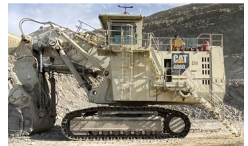
CAT6060 Face Shovel #FS14 Fitted with BK UC