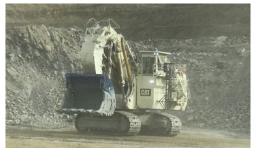
CAT6060 Face Shovel #FS15 Fitted with BK UC & BK HFS Manufactured Bucket.