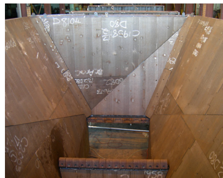
Duaplate D80 Application