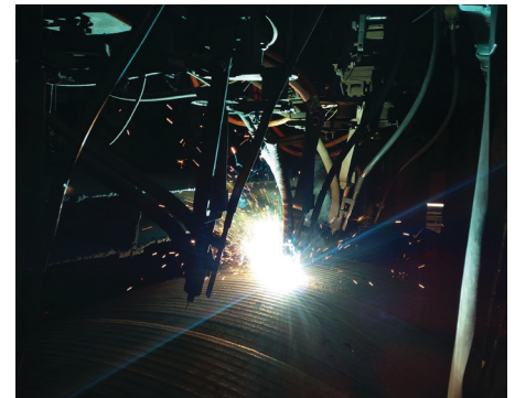
Duaplate Manufacturing Process