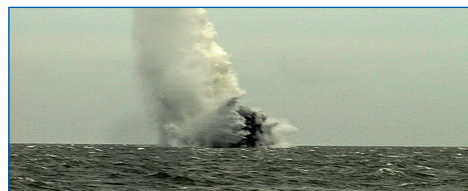
Controlled explosion of the bomb out in the sea