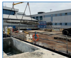
Crane lift of pontoon