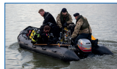
Navy taking the bomb out to sea