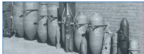
The ordnance which was found at the airport was 500kg and is the 3rd one from left to right.

The airport has taken on board some of the feedback received from local residents following the incident. Feedback was largely positive which naturally included some areas of communication that needs improving. An agreed action point was to have information available via the London City Airport Consultative Committee website and also #LCYlocal Facebook and Twitter pages.