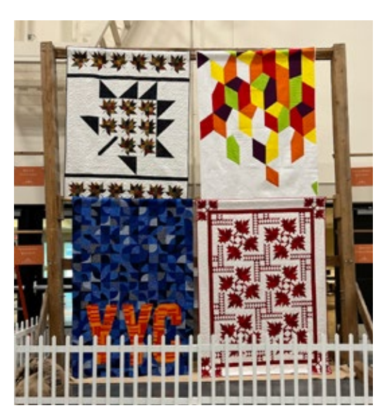
Calgary Modern Quilt Guild, Quilts For Everyday Heroes, and Quilts of Valour

Please come out and visit the guilds, you might just find a new passion in life!