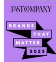
Fast Company Brands That Matter 2023