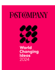
Fast Company World Changing Ideas 2024