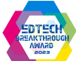
EdTech Breakthrough Award 2023