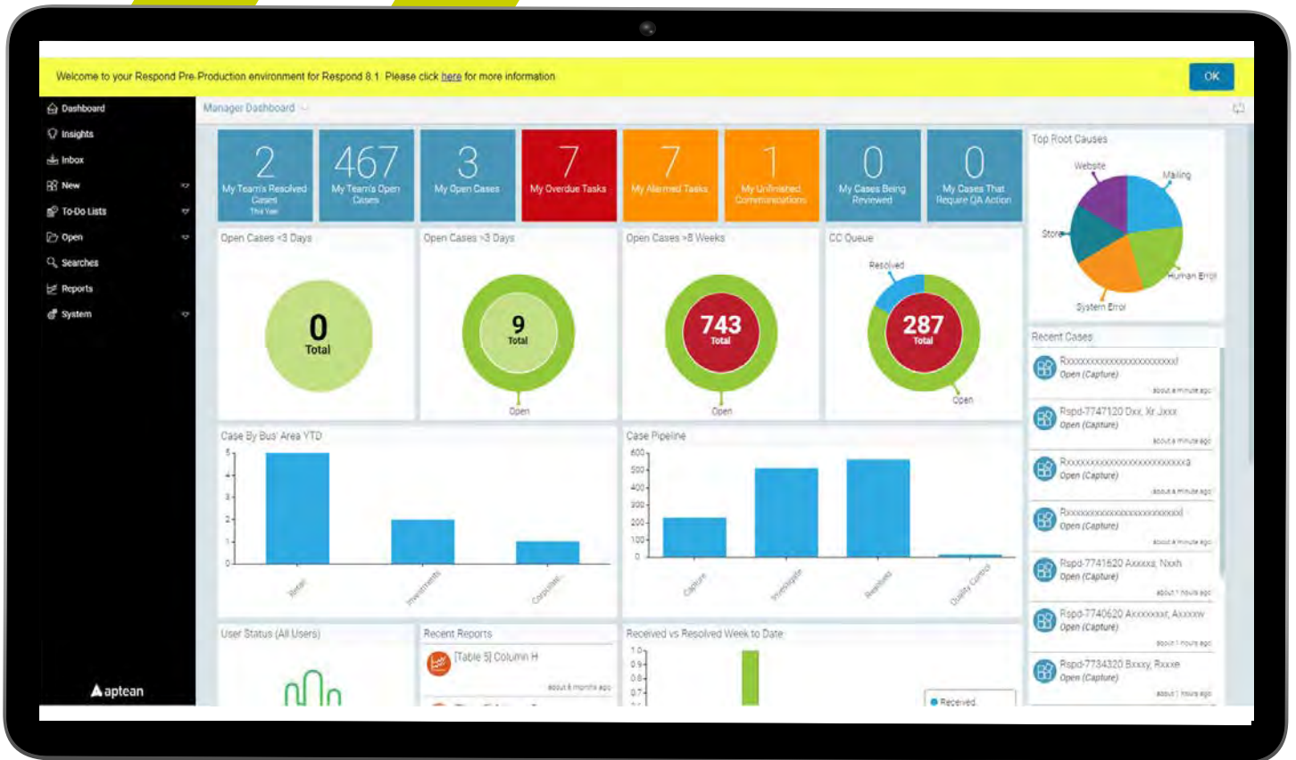
A homepage dashboard in the Pre-Production environment