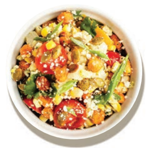
Mexican Street Corn © @ @