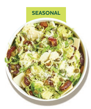
Brussels Sprouts, Dates + Parmesan ♥ 💬 😅