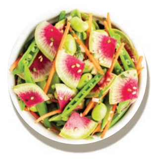
Snap Pea Edamame (9