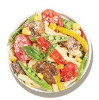
Vegetable Gemelli ⊕