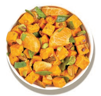
Sweet Potato, Mandarin + Pistachio ఄ���