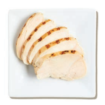
Roasted Chicken Breast $116