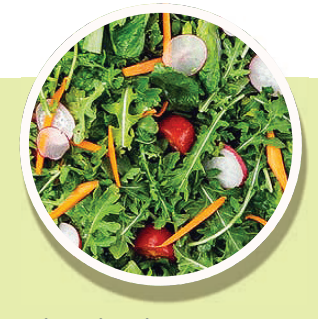
California Mixed Greens ⊕⊕ SMALL $28 LARGE $49