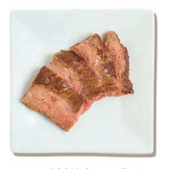
100% Grass-Fed Garlic Rosemary Steak @ $99