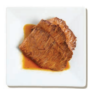
Braised Angus Beef © $135