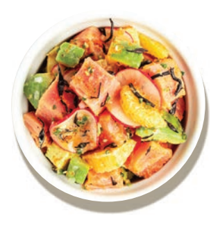
Ahi Tuna Avocado Poke* $89 **sauce not included