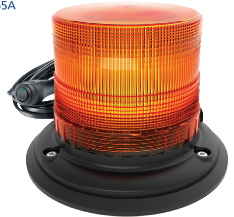
Mag-mount available for both sizes.